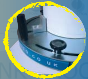
Fast self centring Ink Container Clamping